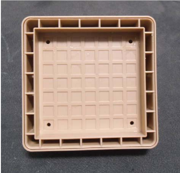
Model TD101 (Top View)