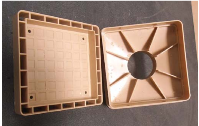
Model TD101 (Drain Tray + Body)