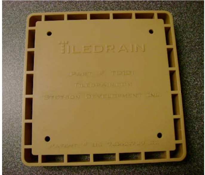
Markings underneath Drain Tray